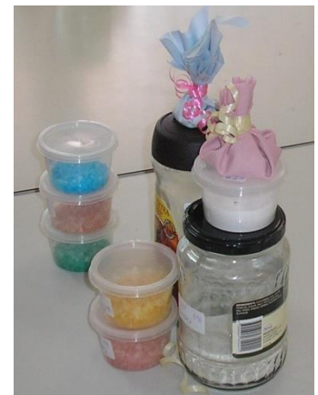
Take home samples Hair & Body Products Workshop