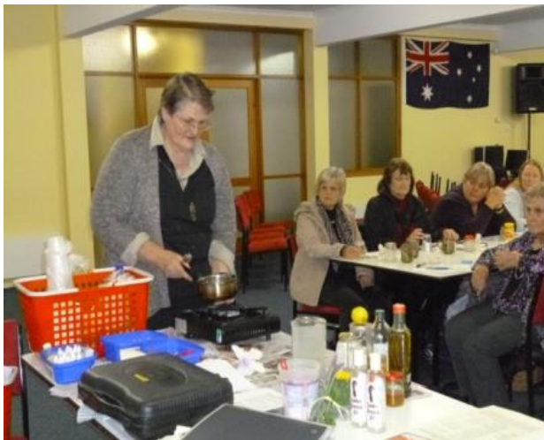
Natural Skin Care - Victor Harbor

Green Cleaning - Natural Skin Care - Chemical Free Living – Environmentally Friendly Living – Recycling - and more