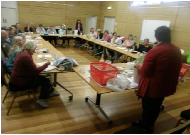
Green Cleaning Workshop - Normanville

Environmental Responsibility Begins in the Home