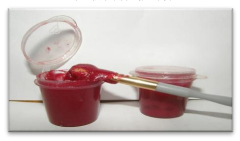
The Advertiser 6/12/07

Environmental campaigners yesterday called for it to be banned in the cosmetics industry, where it is used to make products glossy.