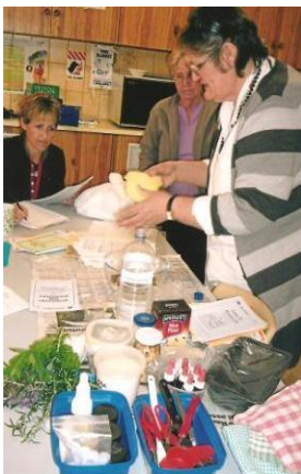
Old Time Kitchen Skills Clarence Park Community Centre

My fee is: $190.00 per 2 hour workshop – plus $5 per person for materials (for their take home products). No other costs – other than petrol for long distance travel to areas outside Adelaide metro. if applicable. Fee is reduced to $170 per workshop if booking for a series of more than three workshops at same venue.